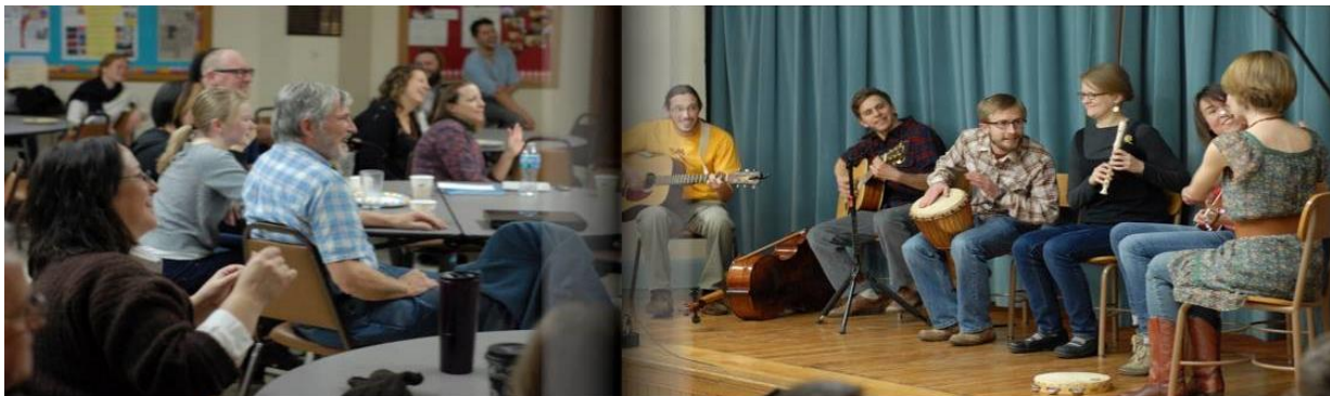
Thirdday regales us with a “lack of talent show”