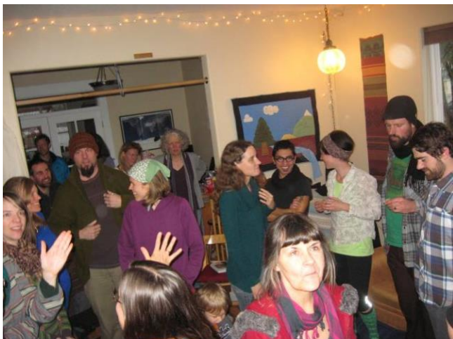
Springwater community folks can't stop talking about the visitation report.

Jan. 22: The Ekklesia House hosted a dinner with leaders from a few intentional communities who used the time to talk with each others issues and to explore how to build some friendships at before, possibly, convening a summer gathering the communities in the Twin Cities.