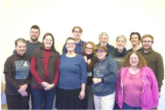
SMC Coordinators from Waco, Evanston, Tiskilwa, San Francisco, and St. Paul.